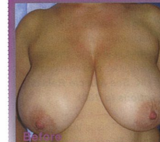
Nurse Consultant Frances Furlong www.perfectskin.co.uk/www.radiesse.eu

Dermal Filler & Medical Micro-Needling Before and six weeks after treatment with 1.5 cc of Radiesse given each side for cheek augmentation, nasolabial folds, followed by InspiraMed dermal roller treatment 1.5 mm depth and topical DMAE, Sillica Organica and vitamin C pre and post treatment.