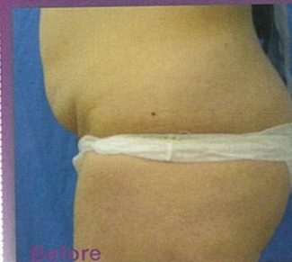
Nurse Consultant Frances Furlong www.perfectskin.co.uk/www.radiesse.eu

Dermal Filler & Muscle Relaxing Injections To make the patient look more refreshed, I have combined Radiesse and Bocouture. I injected Radiesse into the cheek area and Bocouture, a muscle relaxing treatment, in to the frown area and lateral eyebrows. After photo taken at six weeks post treatment.