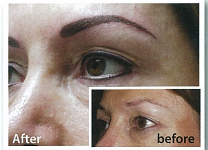
Power Brow and Thick Dark Eyeliner

Most clients want their brows improved upon, without the hassle of applying makeup everyday or to have the assurance that they won't wipe or smudge during their activities. Those women who have lost their eyebrows, of which there are many, want their features to appear more balanced. Eyeliners make our eyes "stand out" and look bigger. Those with fair complexions or fine eyelashes need eyeliner to define their eyes. We can create amazing looks from almost invisible to strong and defined and a personal consultation will determine what is best for each individual.