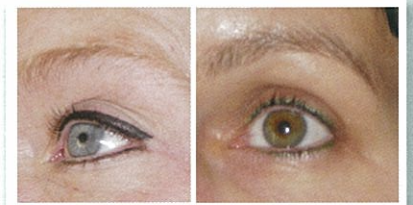
Thick Black Eyeliner