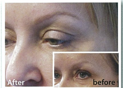
Super Blonde Brow