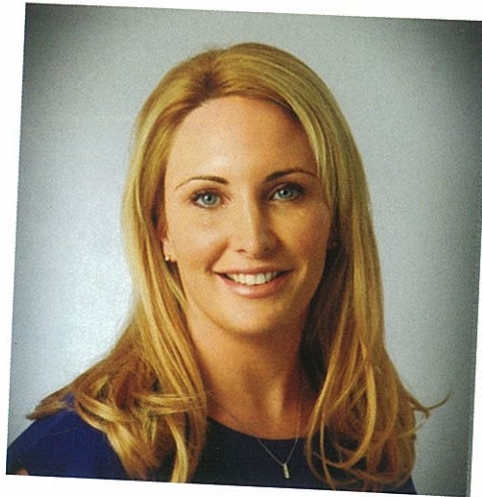
Perfect Skin by Frances Furlong

She also felt her lips were not well defined and losing their contour and border so lipstick would bleed. Also her eyebrows were quite flat and hers looked tired due to crows feet and she wanted a smoother chin too. Caroline had intense pulsed light treatments to help with broken veins and redness to her face. Glycolic peels to freshen the skin and close pores, muscle relaxing injections to crows feet and frown lines to open the eye area. Restylane dermal filler was also given to enhance and define her lips and smooth lines to chin and around the mouth area.