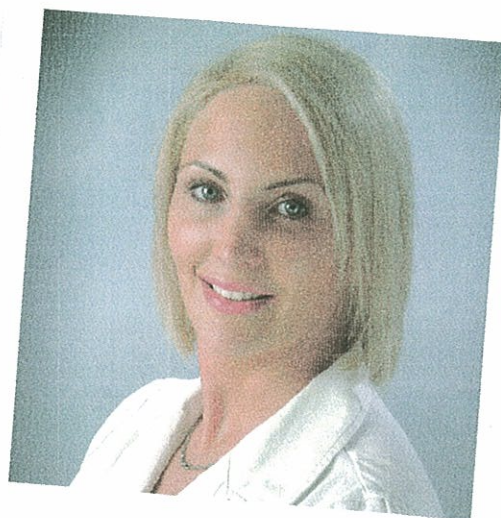
Perfect Skin by Frances Furlong

On a regular basis we see in a newspaper or on the television sensational stories of dermal fillers going wrong or people looking unnatural, or having the puffy pillow faced look. But no-one ever seems to focus on the millions of people who have used, and are regularly using fantastic safe products like Restylane and Emervel.