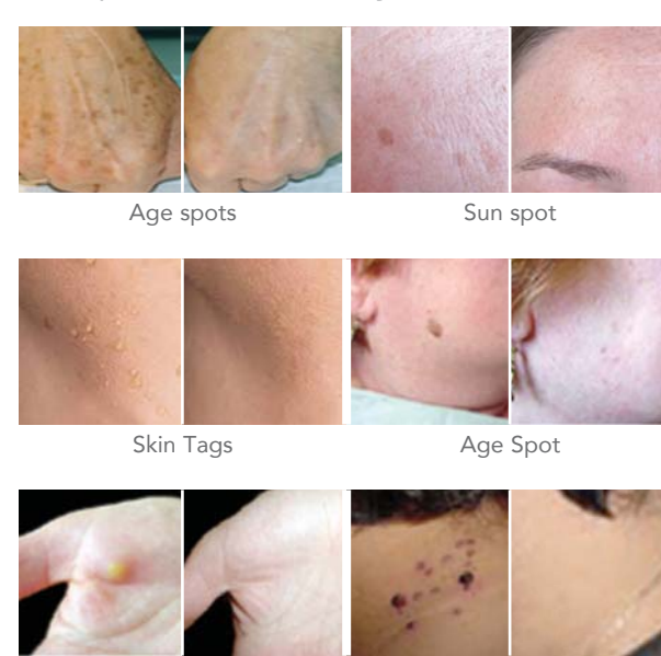
Examples of what the CryoPen™ can do...