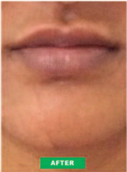
Photo B a single treatment of dermal filler has been administered, client also using daily vitamin C as a natural skin lighter to help discolouration to skin tone.